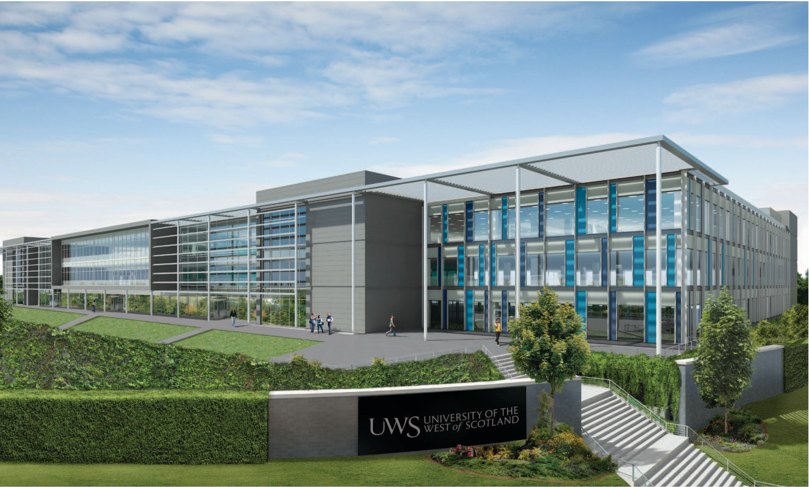
ARTIST'S IMPRESSION OF THE NEW LANARKSHIRE CAMPUS

The formal signing of the contract to take forward our new Lanarkshire Campus, in partnership with South Lanarkshire Council, was completed in October 2016, and the project is now officially underway.