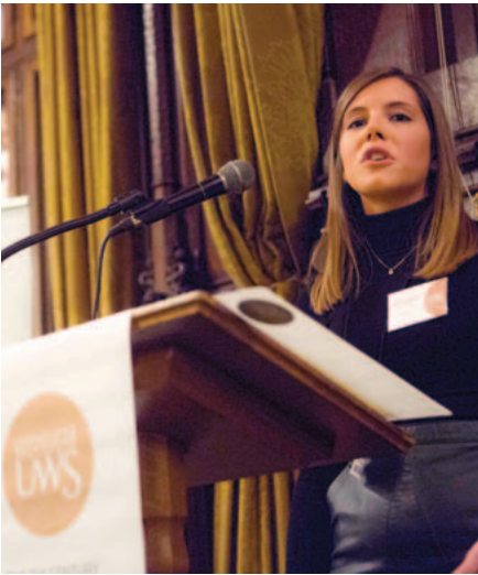
UWS HOUSES OF PARLIAMENT EVENT