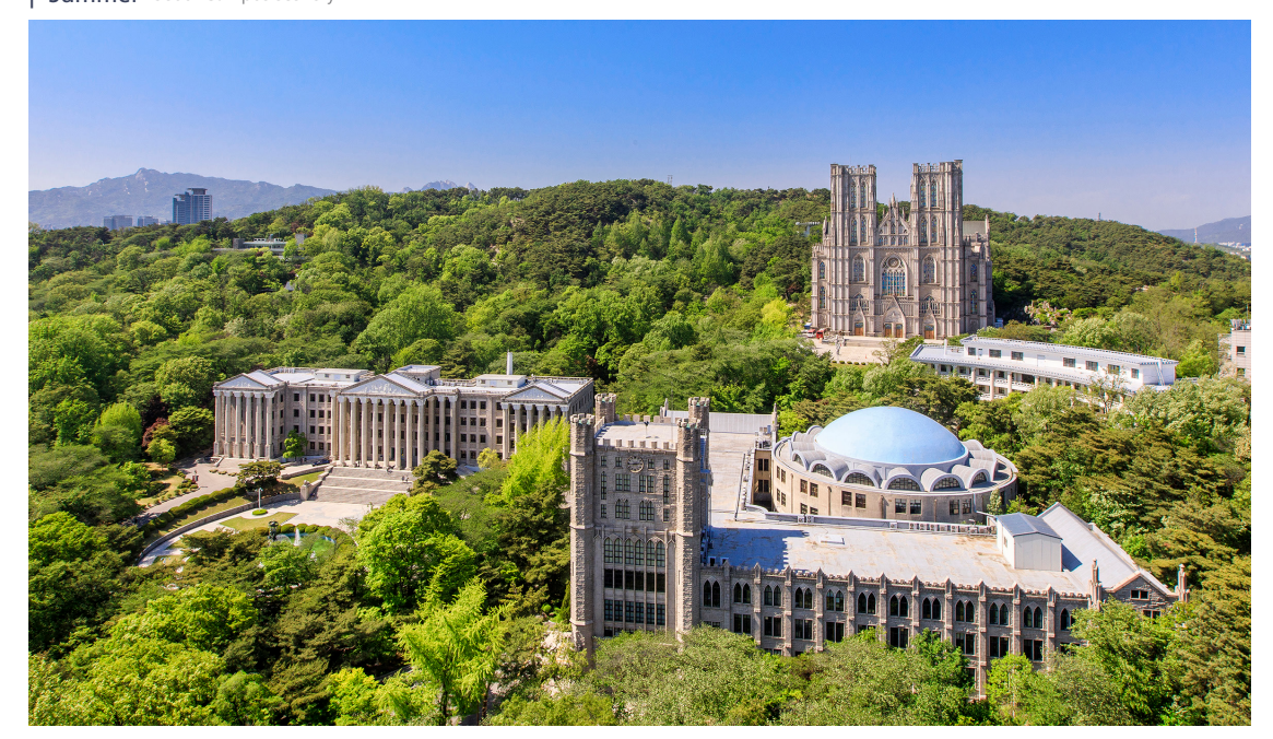
| Summer Seoul Campus scenery