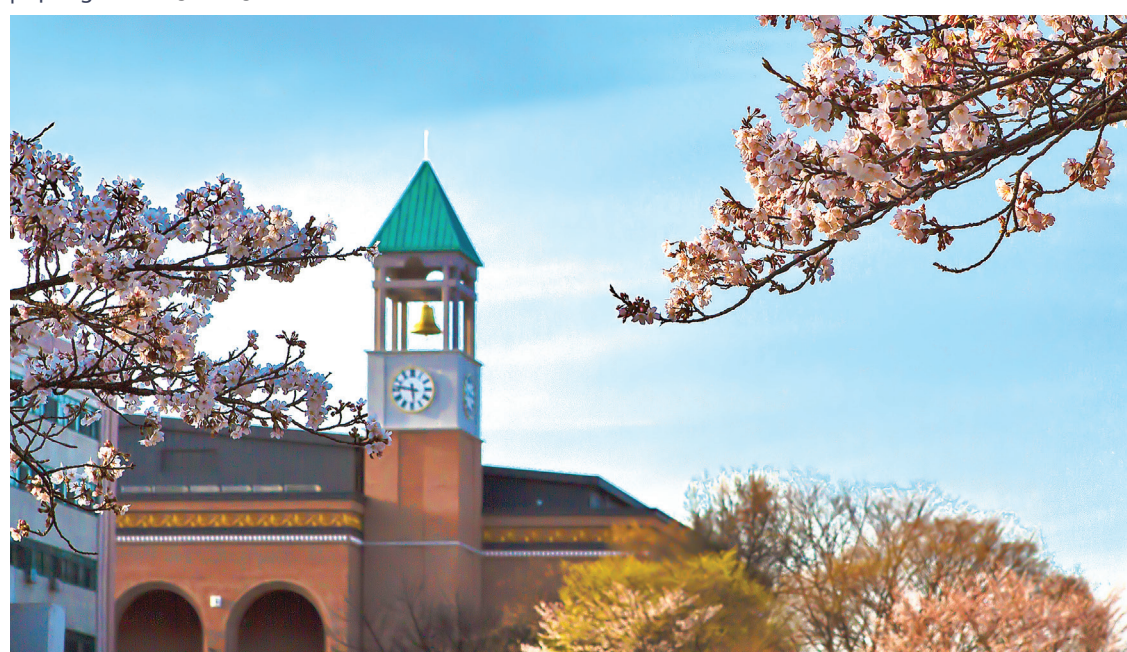
| Summer Central Library (University Administration Hall)