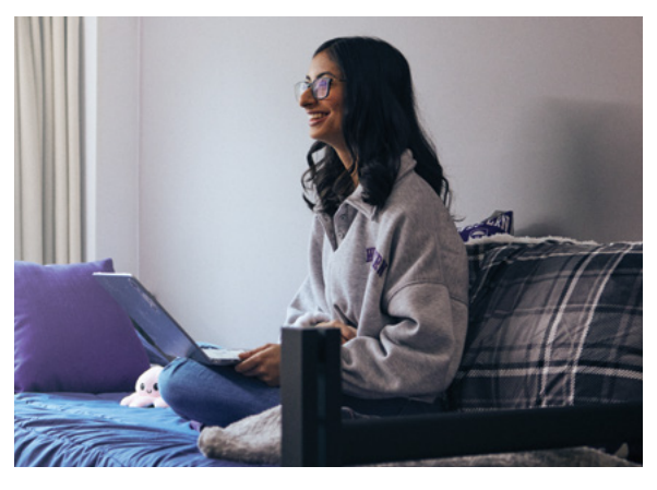
Residence is guaranteed for first-year students based on eligibility requirements being met

As a Western student, you will receive a top-notch education and create bonds that will last a lifetime. No matter your interests and degree path, you will find your purpose and place amongst our diverse and tight-knit campus community of 44,000+students from 128 countries worldwide.