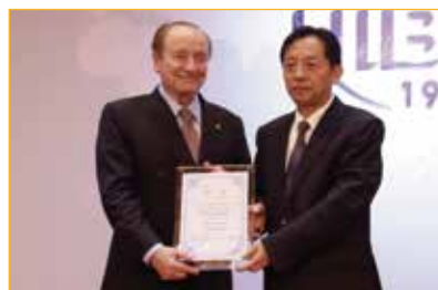
Professor Robert Carhart Merton, Nobel Prize Laureate