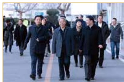
H.E. Mr. Chen Baosheng, Minister, Ministry of Education, P. R. China

Located in the Chaoyang District of Beijing which is abundant with business development vitality and international influence, UIBE offers its students the opportunities to participate within international business and cross-cultural activities to develop cross-cultural awareness and global vision. UIBE has 75 student clubs open to both Chinese and international students that have held hundreds of multicultural activities and academic forums on campus, including the International Culture Festival, Ambassadors Forum, and Global Village Week. Each year, UIBE invites hundreds of leaders of government bodies and international organizations, senior scholars from leading universities or institutions, and CEOs of multinational corporations to give lectures or seminars.