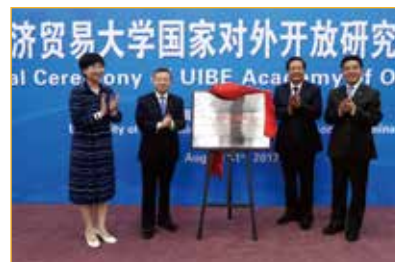
Inaugural Ceremony of UIBE Academy of Open Economy