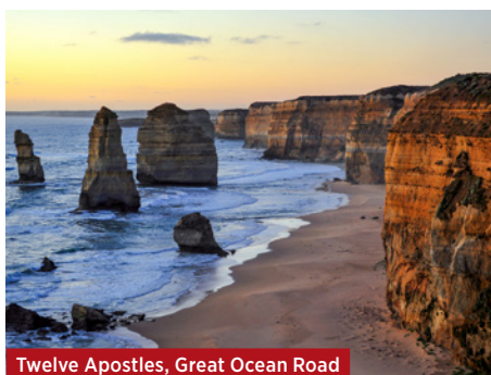
Twelve Apostles, Great Ocean Road