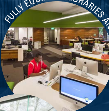
FULLY EQUIPPED LIBRARIES AND STUDY HUBS