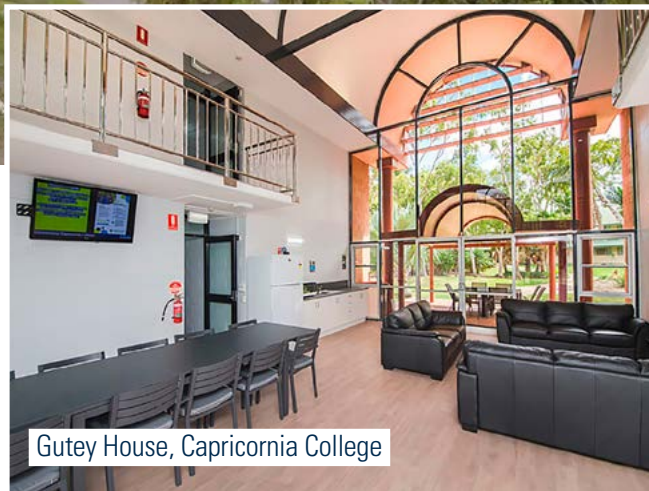
Gutey House, Capricornia College