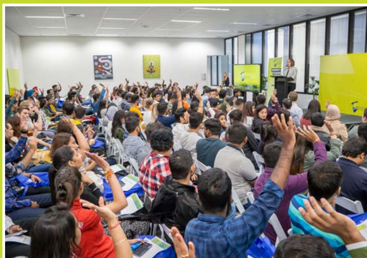
Melbourne campus orientation