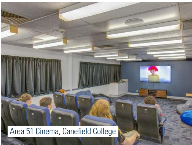
Area 51 Cinema, Canefield College