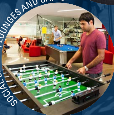
SOCIAL SPACES, LOUNGES AND CAFÉS