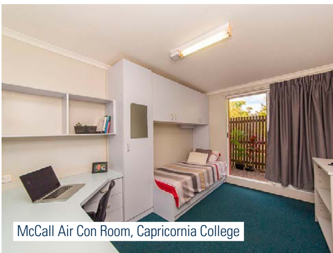
McCall Air Con Room, Capricornia College