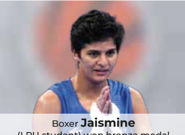
(LPU student) won bronze medal (Commonwealth Games 2022)