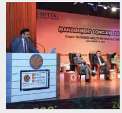
MANAGEMENT CONCLAVE 2019 BUSINESS AGILITY IN VOLATILE TIMES