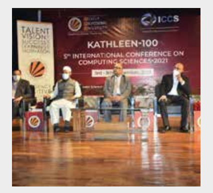
KATHLEEN-100 5<sup>th</sup> INTERNATIONAL CONFERENCE ON COMPUTING SCIENCE- 2021