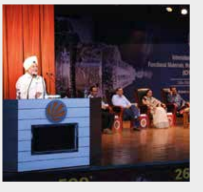
UNCTIONAL MATERIALS, MANUFACTURING AND PERFORMANCES (ICFMMP-2019)