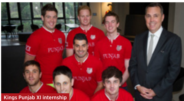
Kings Punjab XI internship

You'll also get hands-on experience through on-campus facilities like our TV studio, health sciences clinics, and Moot Court, or on field trips to places ranging from a UNESCO archaeological site in South Africa to Victoria's alpine wilderness.