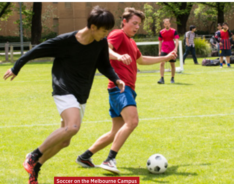
Soccer on the Melbourne Campus

There is a lot more to being at La Trobe than going to class and working on assignments. We are the best University in Victoria for international student experience* and we encourage you to get involved and have the experience of a lifetime!