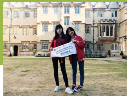
▲ 牛津及劍橋大學 2018 暑期項目 Summer Program 2018 at Cambridge University and Oxford University

澳門科技大學與海外和內地數十所大學建立了友好合作關係，為本科生和研究生提供長期或短期的出國交流機會，使同學可以按照自己的要求和興趣，選擇在海外院校繼續攻讀外國學位、研修專業課程、進修英文和參與跨文化實習項目等等。涵蓋廣泛的暑期課程也為學生提供了在暑假期間在國外生活的絕佳機會，這將是學生們探索新國家和結交新朋友的好方法。