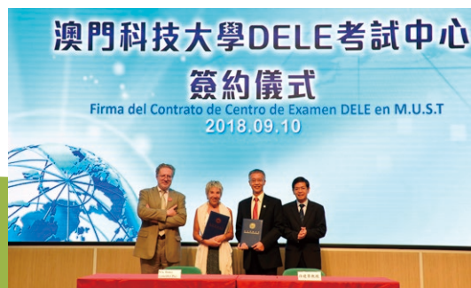
▲ DELE 考試中心正式成立 (西班牙語) DELE Examination Center at MUST (Spanish)

MUST summer study abroad program can particularly help our students improve their understanding and appreciation of other cultures, apply their knowledge through field placement, and upgrade their language skills in a target language environment. Senior students may be selected to participate in The Cross-Cultural Internship Program in New York that lasts seven weeks. This unique opportunity can offer our students a deeper insight in the cultural differences between companies in the East and the West, thus benefiting their future career development.