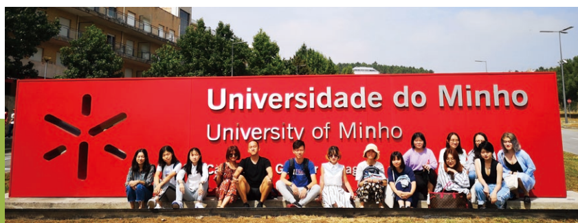
▲ 國際學院學生赴葡萄牙米尼奧大學交換 MUST exchange students at University of Minho, Portugal

澳門科技大學為開闊學生的國際視野，尤其鼓勵同學們利用暑假期間參加國外大學的各種學習和實習計劃，通過學習及進行實地考察，體驗外國的教育和生活文化，感受世界不同地方的風土人情，同時也可以提升語言能力。高年級的同學還可以參加美國紐約跨文化實習 (The Cross-cultural Internship Program)，項目為期 7 週，通過在當地公司參與實際工作和活動，從實踐中瞭解商業操作和感受東西方文化差異，同時也能學習工作技巧，為將來進入社會打下堅實的基礎。