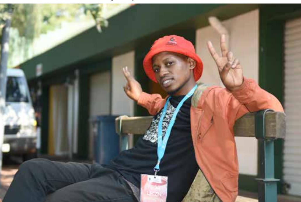
UKZN alumni launches Online Learning Academy.