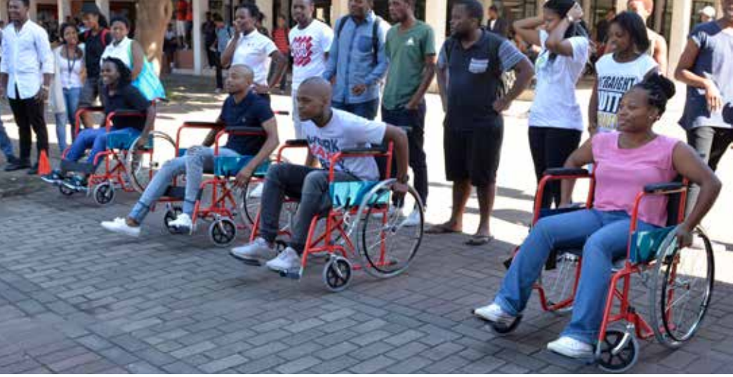
Indigenous Recreation and Sports Day.