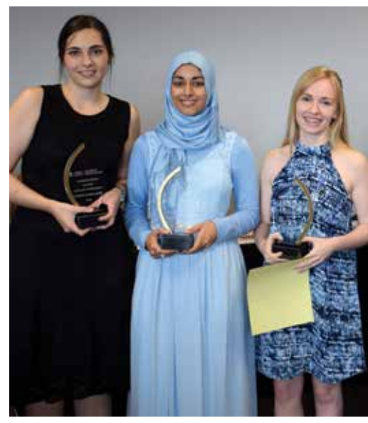
Triple dose of excellence in Occupational Therapy.

The qualification, Bachelor of Occupational Therapy, allows the graduate to register with the Health Professions Council of South Africa as an occupational therapist. Occupational