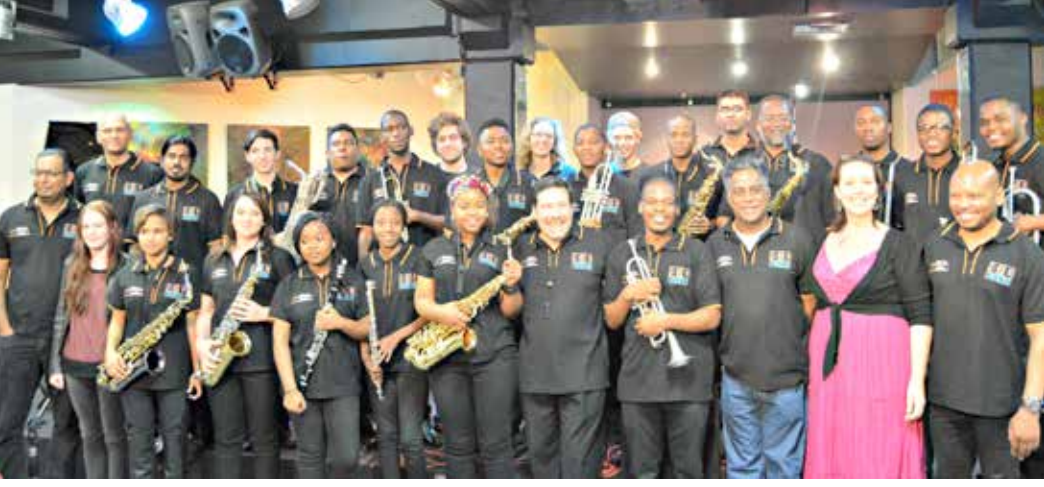
UKZN Big Band.

a fourth year and attain the Bachelor of Practical Music degree. Candidates who do not fully meet the above entrance requirements may be admitted to a oneyear foundation programme in Music.