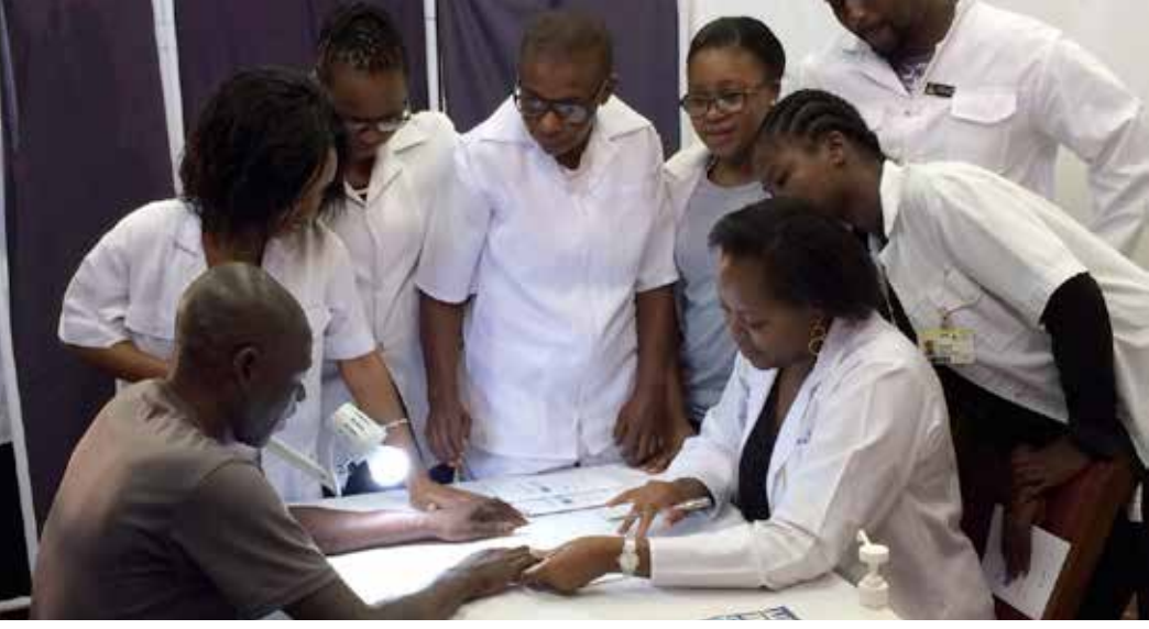
Dermatology reaches out.