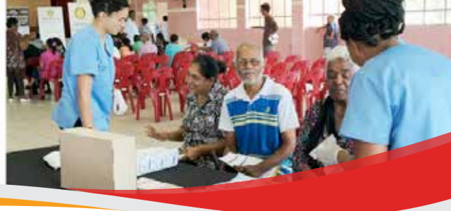
Dental Therapy students reach out to the elderly.