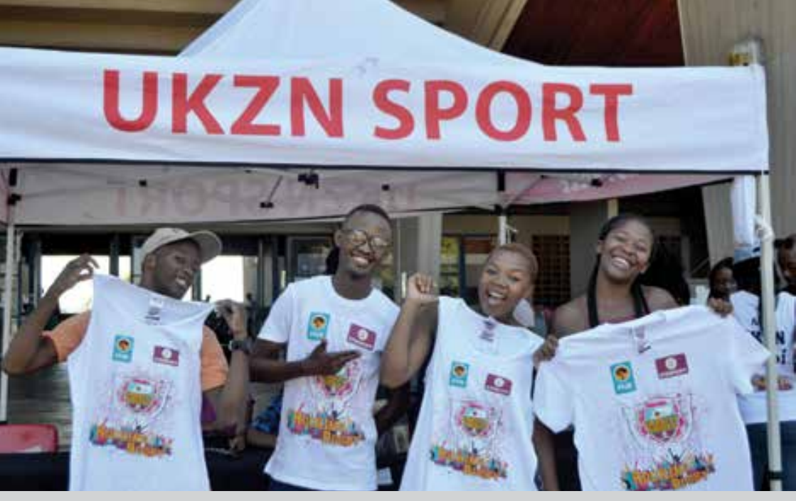
Supporters of Varsity Shield.