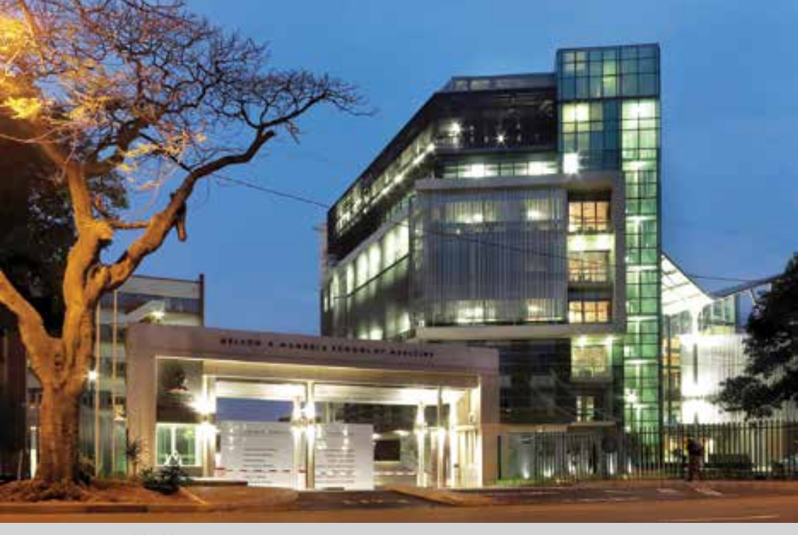
UKZN K-Rith building.

Education, Law, Human and Management Sciences. The disciplines of Agriculture, Theology and Fine Art are unique to the Pietermaritzburg Campus.