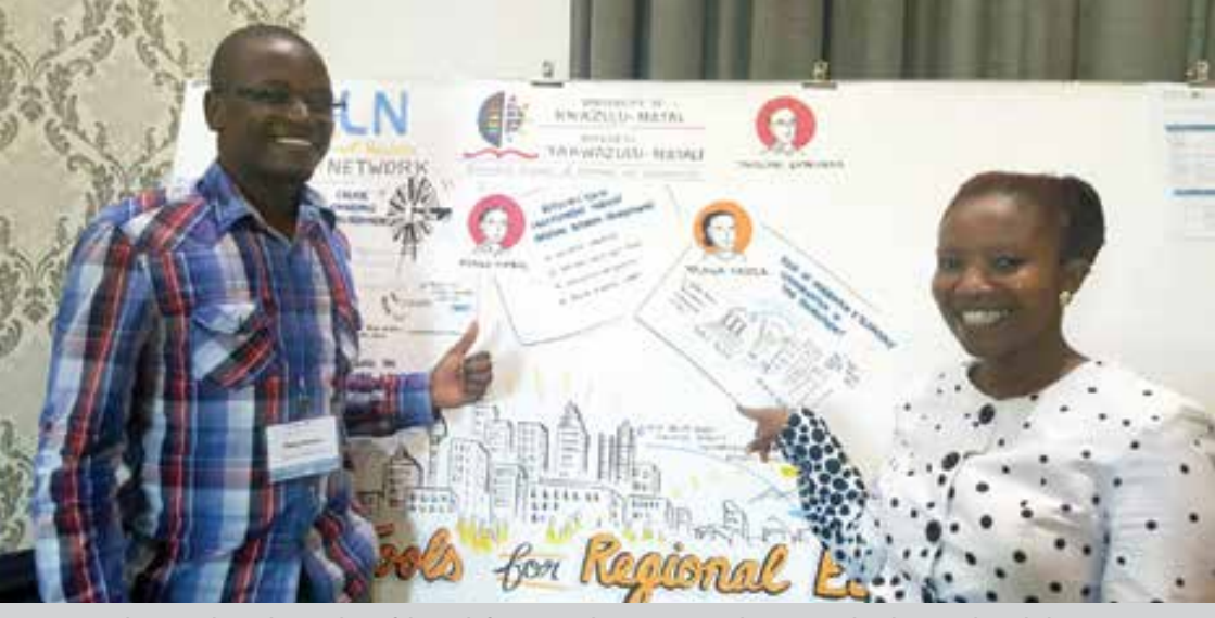
Enhancing the understanding of the tools for Regional Economic Development and exchanging knowledge between government departments, institutions of higher learning and RLED practitioners, was the goal of the Economies of Region Learning Network event hosted by the Graduate School of Business and Leadership.