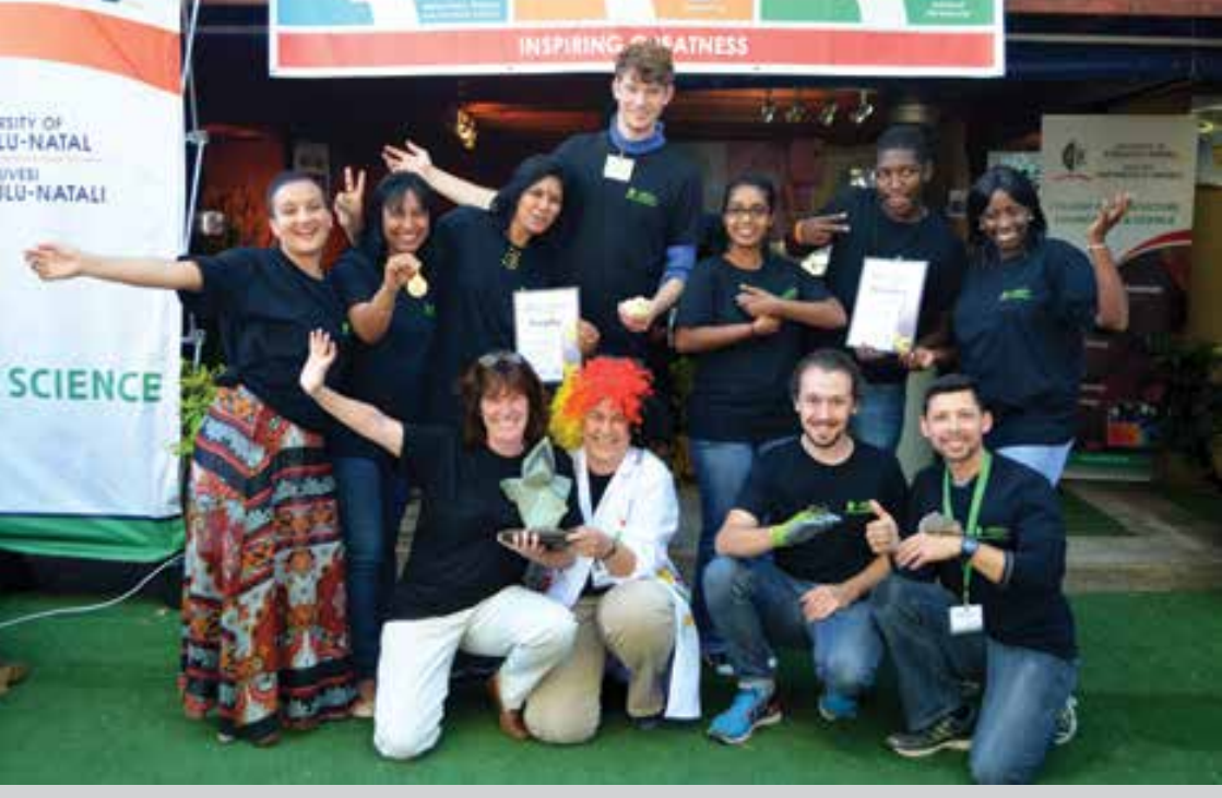
The Royal Show.

November (10 months) for the full academic year;