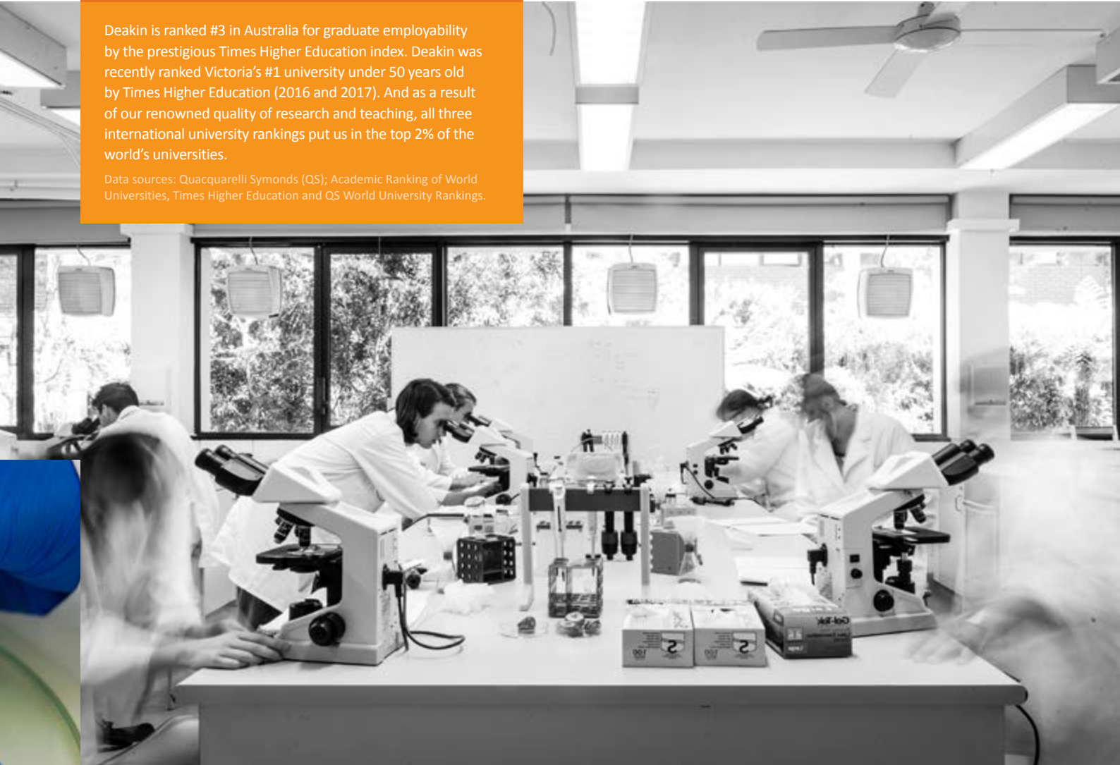
Science laboratory, Melbourne Burwood Campus.