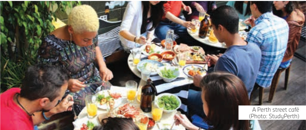
A Perth street café