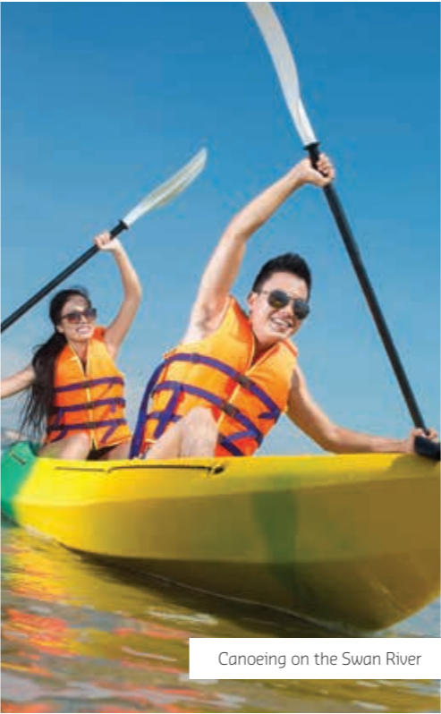
Canoeing on the Swan River