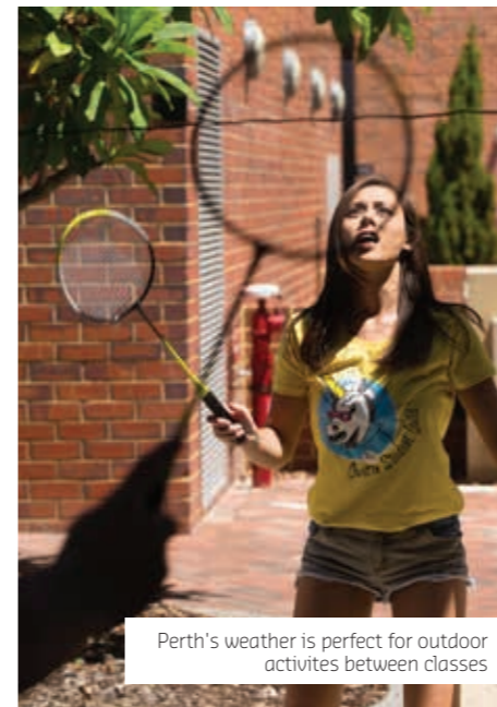
Perth's weather is perfect for outdoor activities between classes

Experience more of the campus vibe on our YouTube channel.