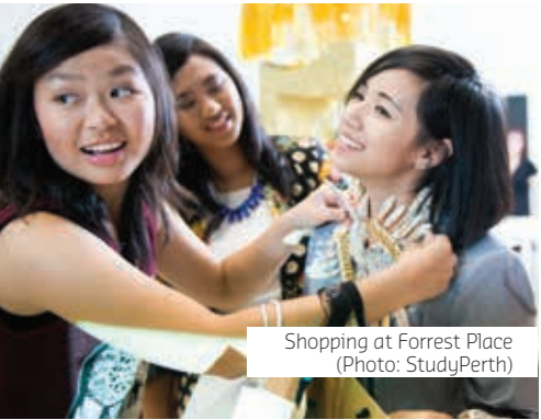
Shopping at Forrest Place