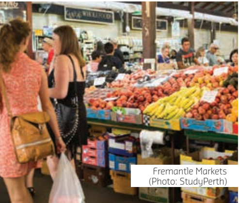
Fremantle Markets