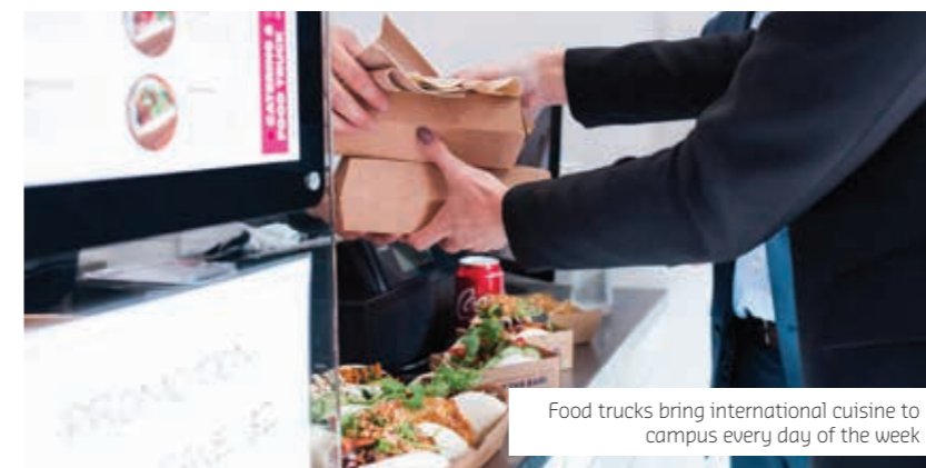
Food trucks bring international cuisine to campus every day of the week