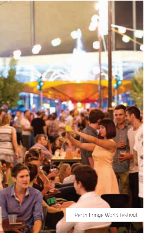
Perth Fringe World festival