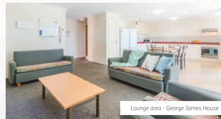
Lounge area - George James House