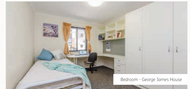
Bedroom - George James House