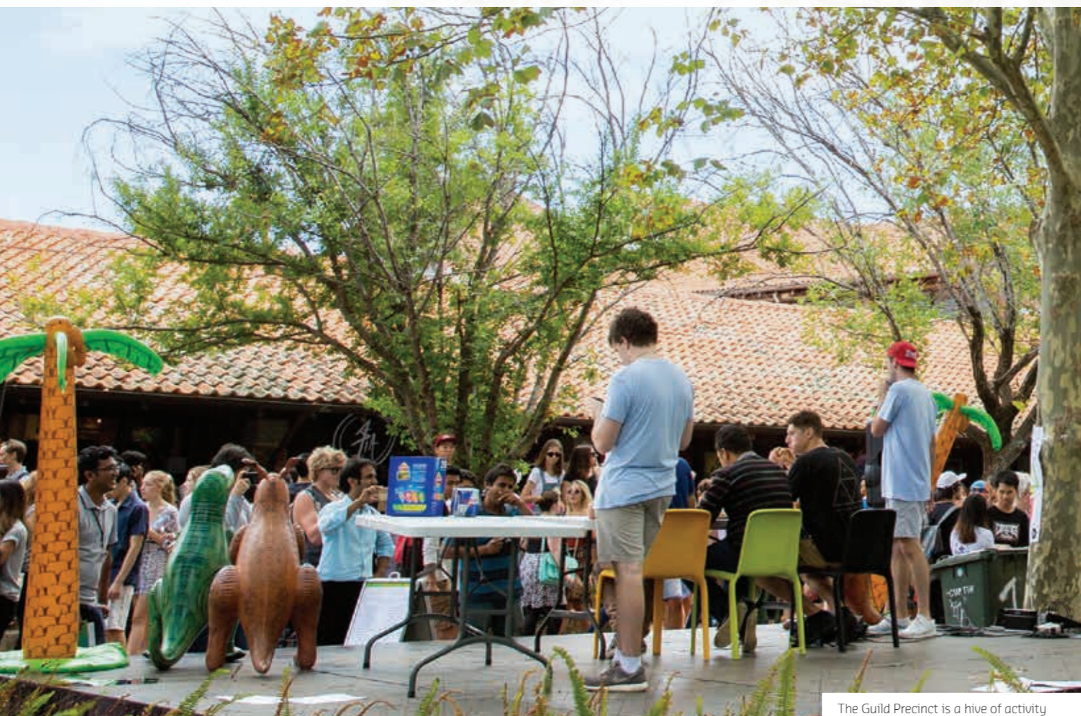
The Guild Precinct is a hive of activity