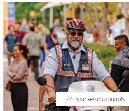
24-hour security patrols

To get more information, see photographs of accommodation, find out about free wi-fi and gym membership inclusions, or fill out an application form, visit: curtin.edu/int-accommodation .