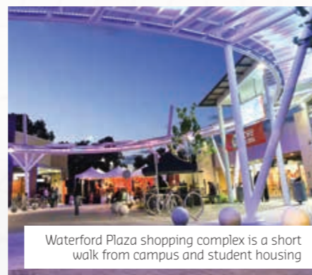
Waterford Plaza shopping complex is a short walk from campus and student housing