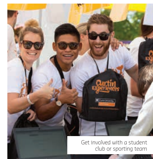
Get involved with a student club or sporting team