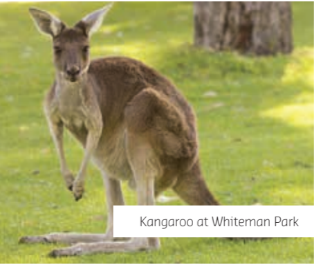
Kangaroo at Whiteman Park