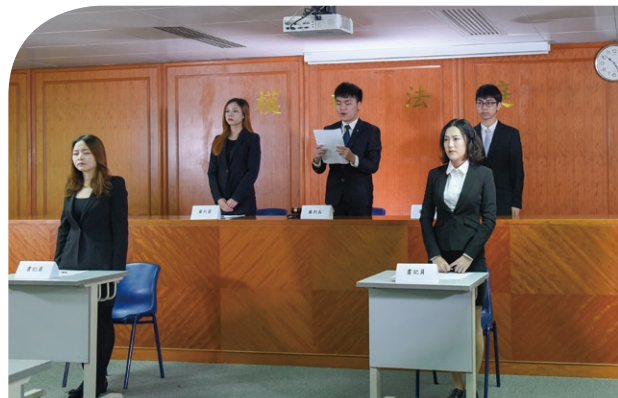
▲ 模擬法庭 Moot Court