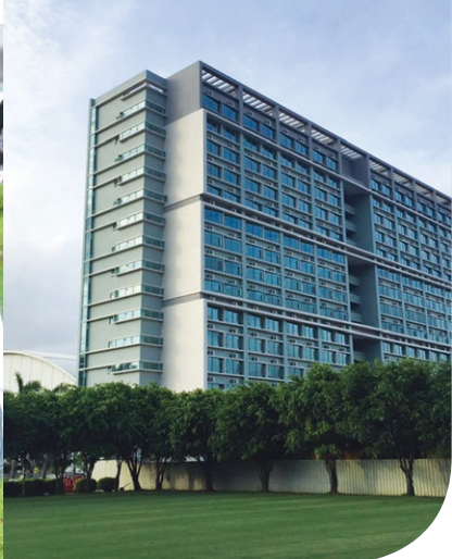
◀ 學生宿舍 Student Dormitory