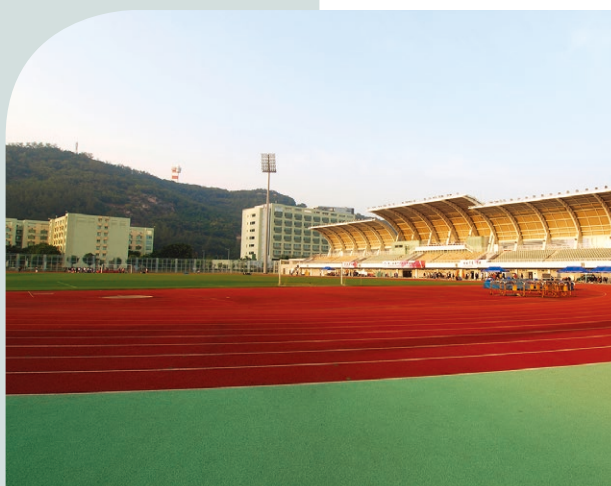
▲ 田徑運動場 Track-and-field Stadium