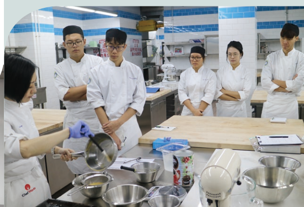
▲ 教學廚房實驗室 Culinary Lab