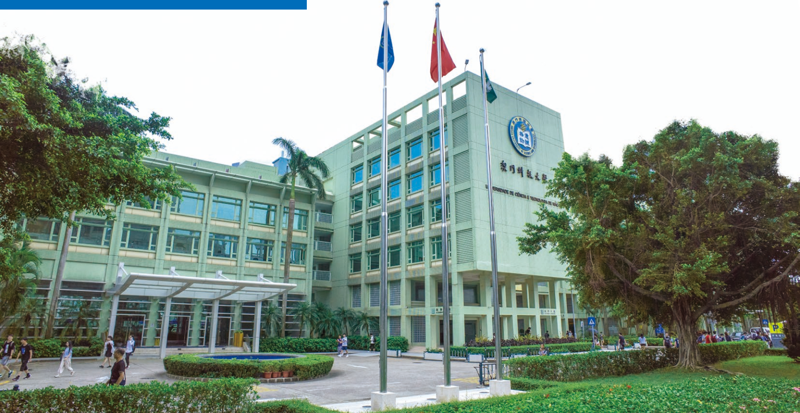
▲ 教學大樓 Academic Building