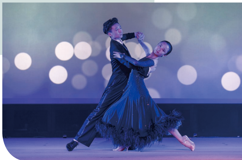
▼ 藝術團 Art Troupe

務。科大醫院設備先進，除擁有本地專業的醫療團隊外，還有一批來自中國內地和香港等地的著名專科醫生。另外，大學配備有 24 小時的保安人員在校園和宿舍巡邏看守，以保障校園環境的秩序。