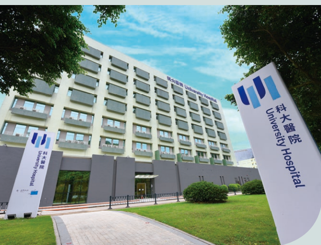
▲ 科大醫院 University Hospital

校園內設置了便利店、銀行中心、學生餐廳、教學餐廳、咖啡閣、電腦室、體能發展中心和具奧林匹克運動會標準的田徑運動場、室內體育館和網球場等設施，提供學生鍛煉和衣食住行便利的場所。位於大學校園內的科大醫院為學生提供 24 小時校醫支援服