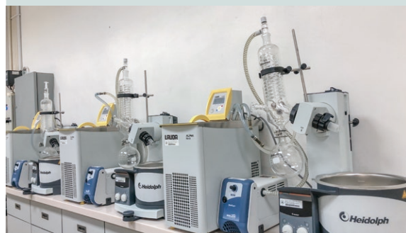
▲ 綜合化學實驗室 General Laboratory for Chemistry