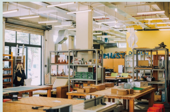
▲ 金木工實驗室 Metal & Wood Art Design Lab