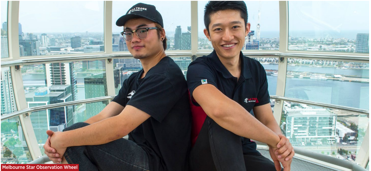
Melbourne Star Observation Wheel

With music, art, food and sport, this is where it's all happening.