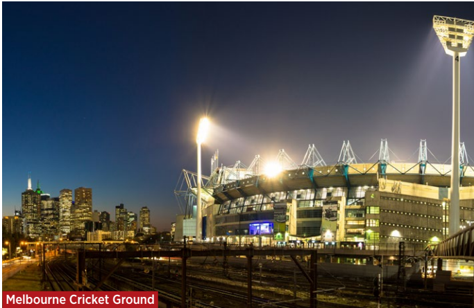
Melbourne Cricket Ground