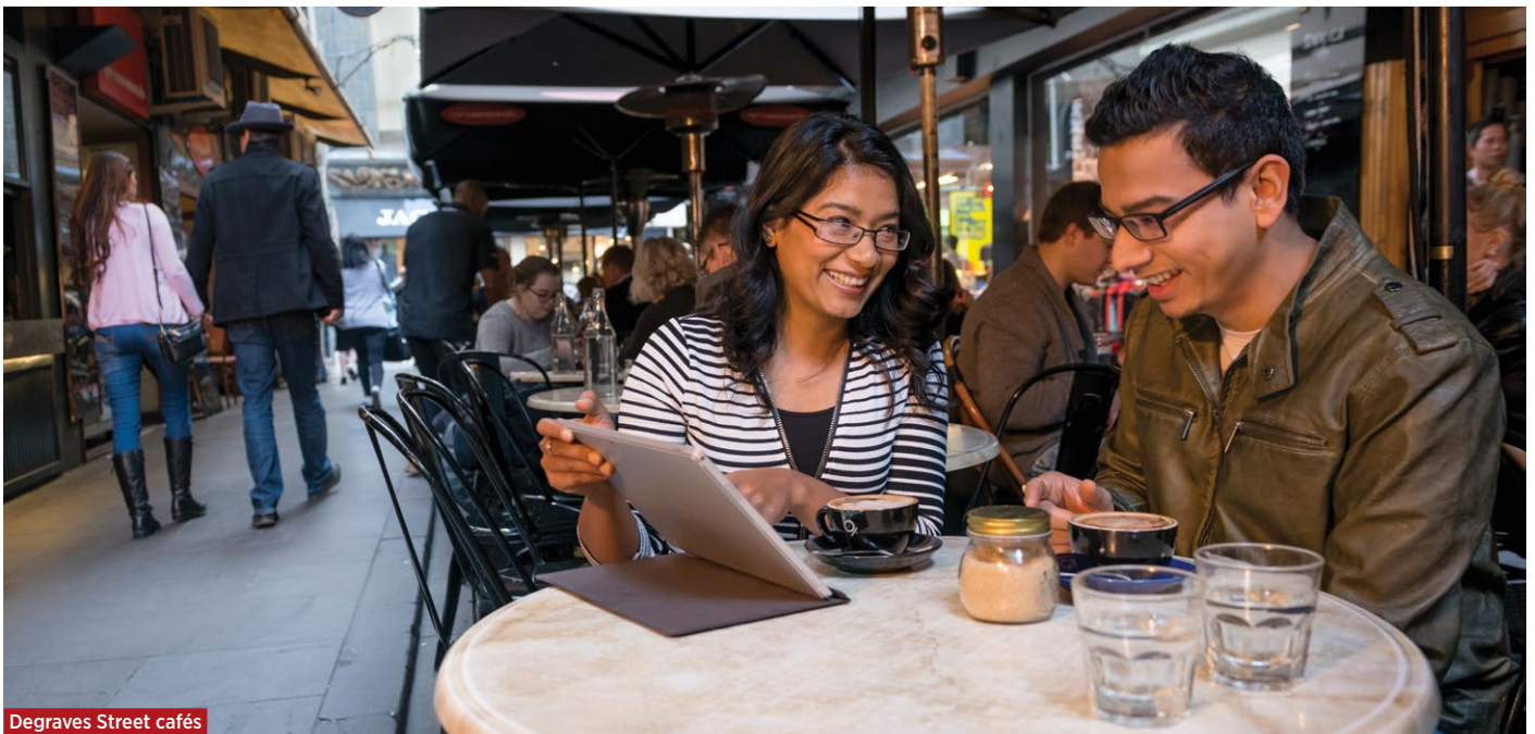
Degra Street cafés