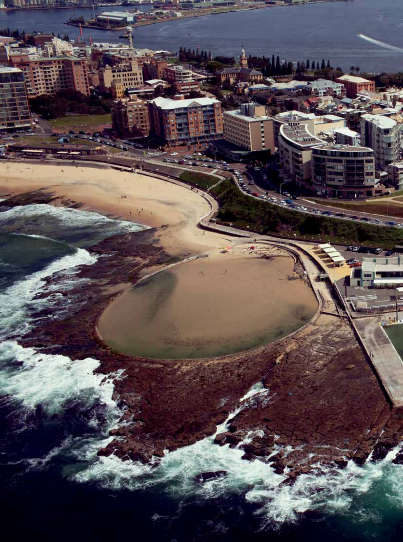
Some of Newcastle's famous coastline on the city peninsula tip.