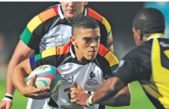
UKZN's Impi rugby team reached the final of the Varsity Shield tournament.