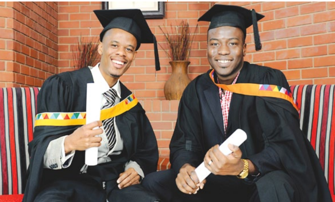
Graduates at the Graduate School of Business and Leadership.