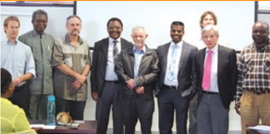
Participants at the Smart Grid Research Seminar.