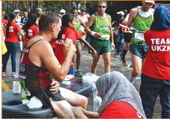
College of Health Sciences students provided a much needed service to Comrades Marathon runners who had been running for over three hours before they could reach the UKZN stand.