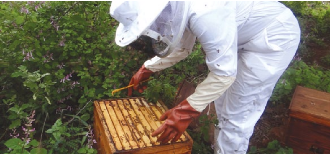
UKZN's Farmers Support Group (FSG) promotes beekeeping at Msinga in an effort to facilitate food security.

The UKZN Language Centre provides a testing service and English language courses for those who do not meet these requirements. After testing, students whose scores are comparable to the required IELTS or TOEFL scores can apply to enter a degree programme. Those who do not are advised to spend one or two semesters learning English in the Language Centre.