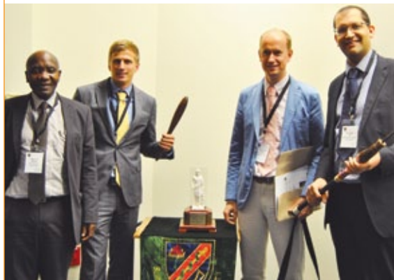
The 42nd annual meeting of the Surgical Research Society of South Africa was hosted by the Department of Surgery, Nelson Mandela School of Medicine.