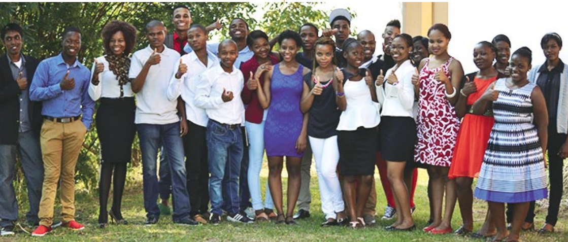
Business professionals were invited to form partnerships with young entrepreneurs.

Tel: +27 (0)31 260 2426 Email: goveni@ukzn.ac.za