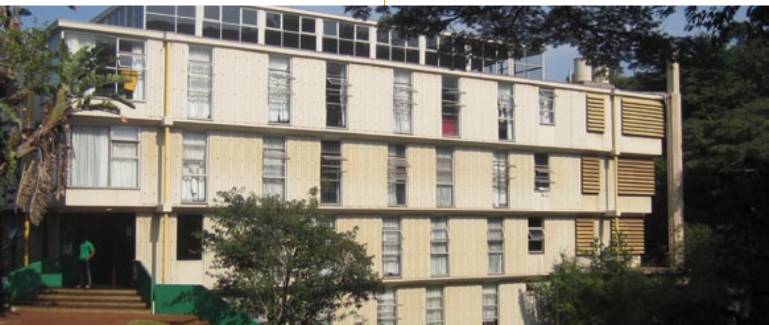
Mabel Palmer Residence, Howard College campus.

As a guideline, a total amount of R24 000 (South African Rand) should be allowed for