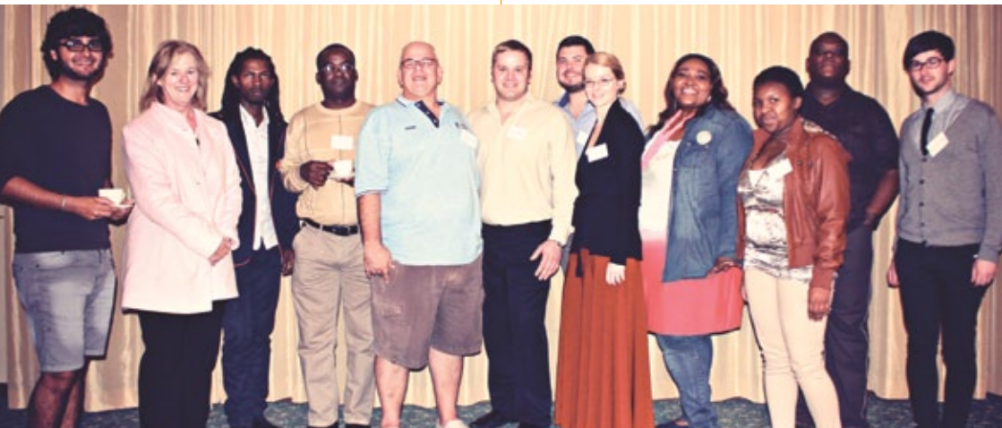
The History Education Programme recently hosted the Historical Association of South Africa (HASA) Conference in Durban.

The vision of the University of KwaZulu-Natal is to be the "Premier University of African Scholarship". It strives to reflect the society in which it is situated, not only in terms of race, gender and class, but in how it structures its values and priorities and how it responds, through its research, to social needs. KwaZulu-Natal provides fertile soil for researchers and the University's mission commits the institution to critical engagement with its society and encourages practical research that will lead to socio-economic upliftment of communities. This outcomes-driven approach has led to the establishment of inter-disciplinary 'centres of excellence' devoted to particular projects and