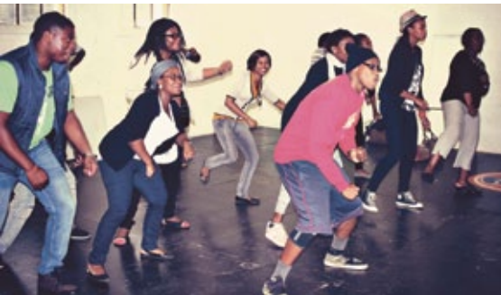
International students participating in a dance class at the BAT Centre.

Please note that the above fees cover tuition fees only. Provision must be made for all other necessary expenses such as accommodation, food, transport and subsistence (see pages 14-15). From the fees listed above, students should take into account only those costs which are relevant to their studies at the University.