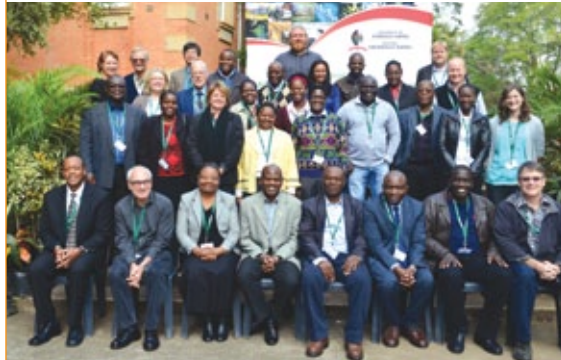
Delegates at the launch of the new MSc Programme in Cultivar Development for Africa.