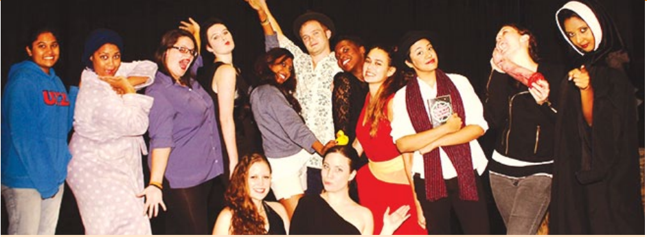
The UKZN Howard College Drama Department proudly presented Death, Dysfunction and a Duck by legendary yet controversial American award-winning playwright, Christopher Durang.