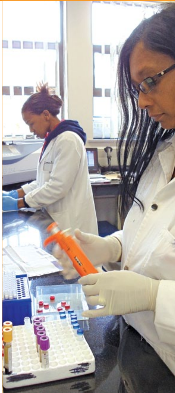
Preparing samples for testing.