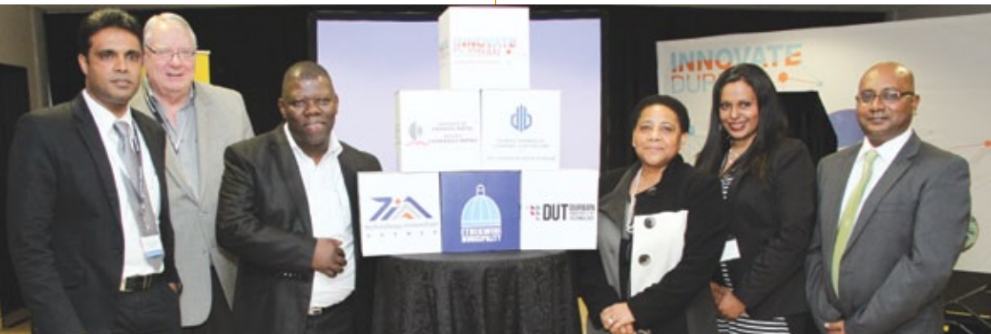
eThekweni Municipality, in partnership with UKZN and other stakeholders, recently launched Innovate Durban during an Innovation Summit at Moses Mabida Stadium.

We look forward to bringing future postgraduate students on board.