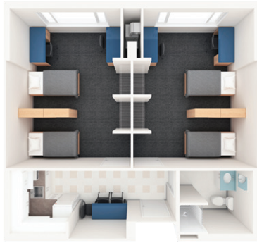
Above: a suite-style room Below: a traditional double room