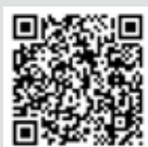
国际教育学院微信公众号

Address: Beijing University of Chemical Technology, No.15 Beisanhuan East Road, Chaoyang District, Beijing